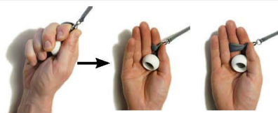
wrapping up w/ knob handles