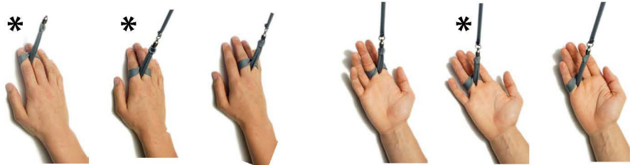
backside finger hitch grip