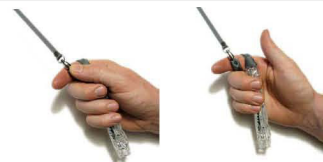
wrapping up w/ flowlight handle